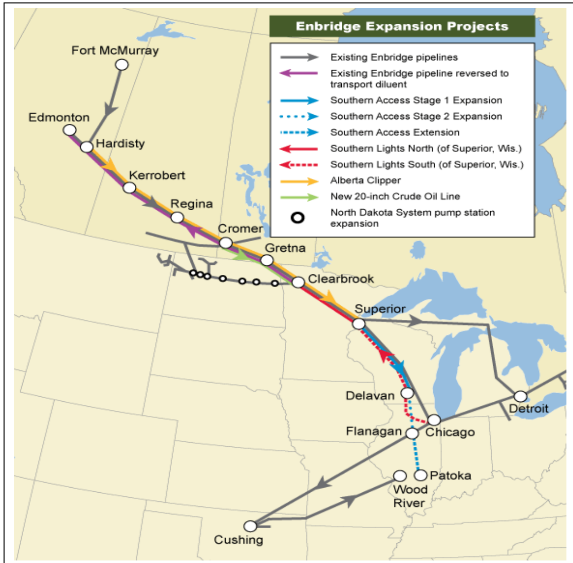
Figure 2: Enbridge Pipeline Expansion