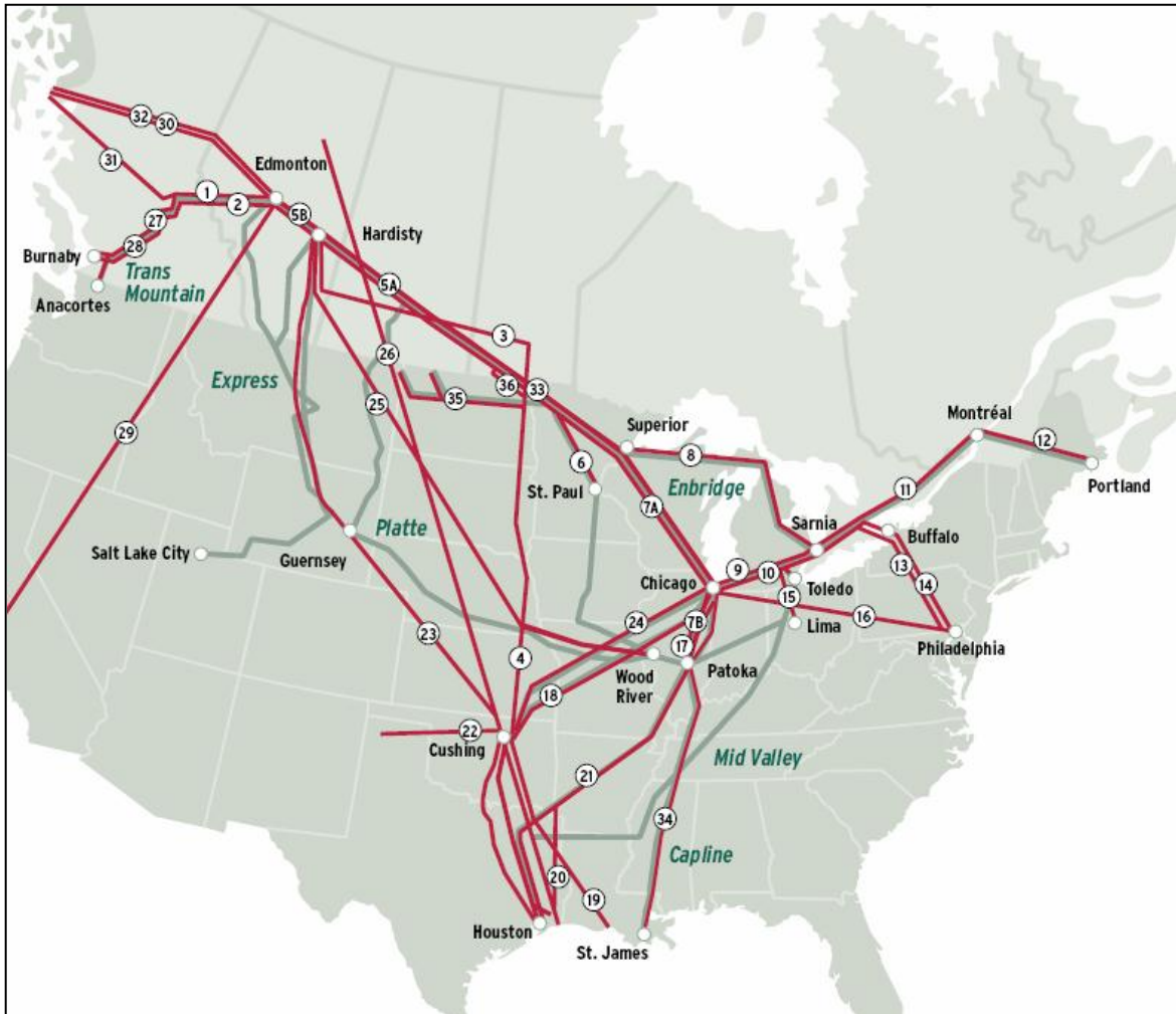
Figure 1: Pipeline Expansions and Proposals